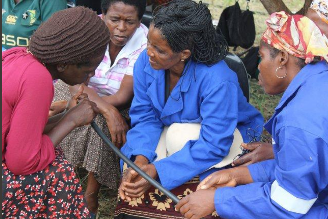
Learning group members grappling with how to construct a drip irrigation kit