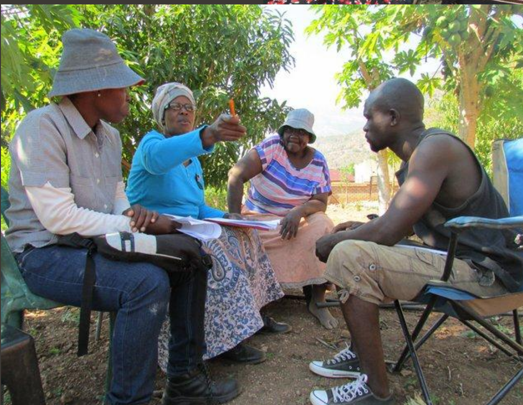
Local facilitators from Willows & Lepelle discussing garden monitoring processes