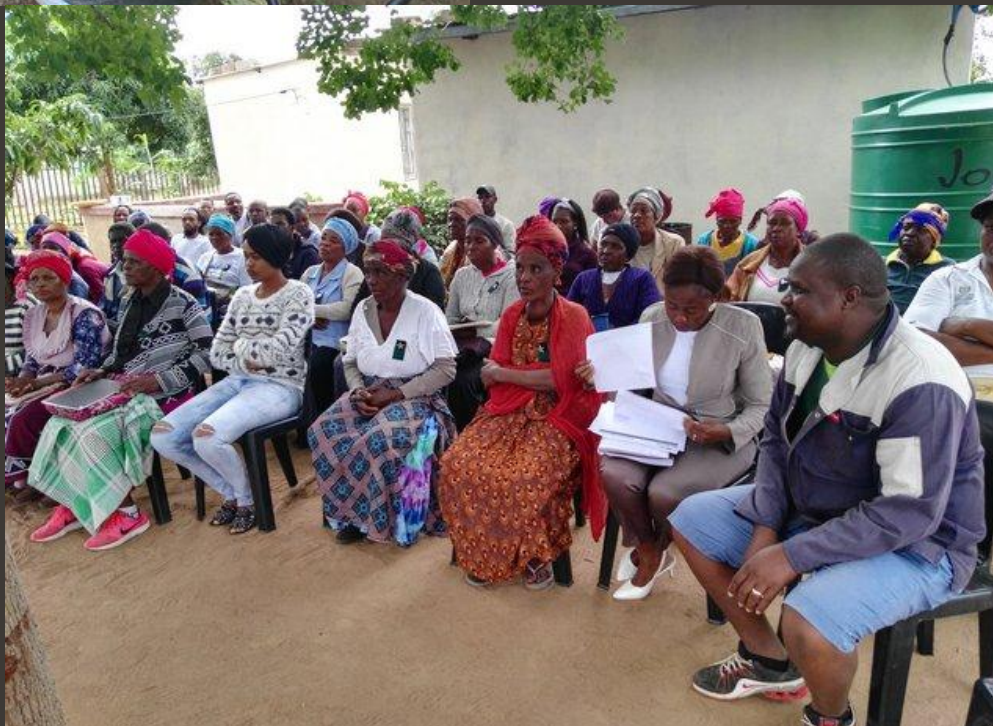
Learning and review session including members from all learning groups