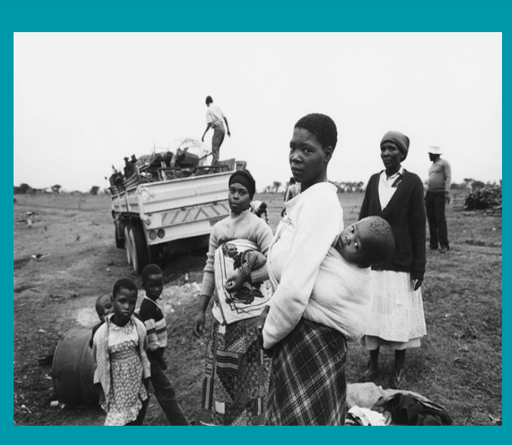
Figure 1: Forced removal picture

This communication or awareness pamphlet is targeted at communities that have claimed land in protected areas within South Africa, and are in the process of or have already negotiated partnerships with the government management agencies for joint management of protected areas. It is also useful for the facilitating organisation and the government agencies and departments involved in the process in their engagement with communities.