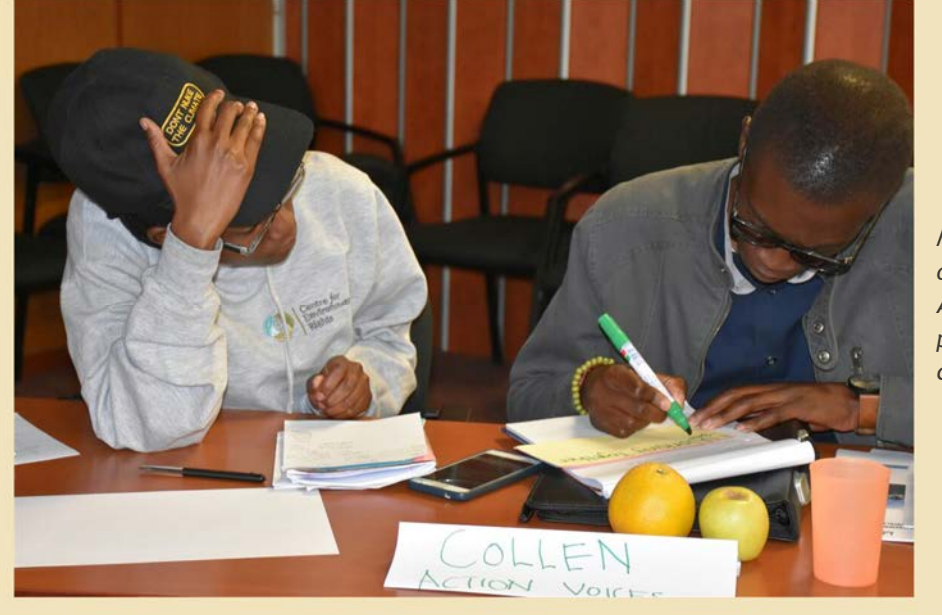
Members of the organisation Action Voices plan for community action.

Without motivation there is little incentive to change or to build preparedness and responsivity. Motivation is usually addressed through identity, recognition and incentivisation. When these are in place, people are guided and motivated to act.