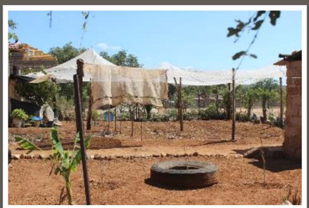
Crops and Moringa trees protected with improvised shade cloth