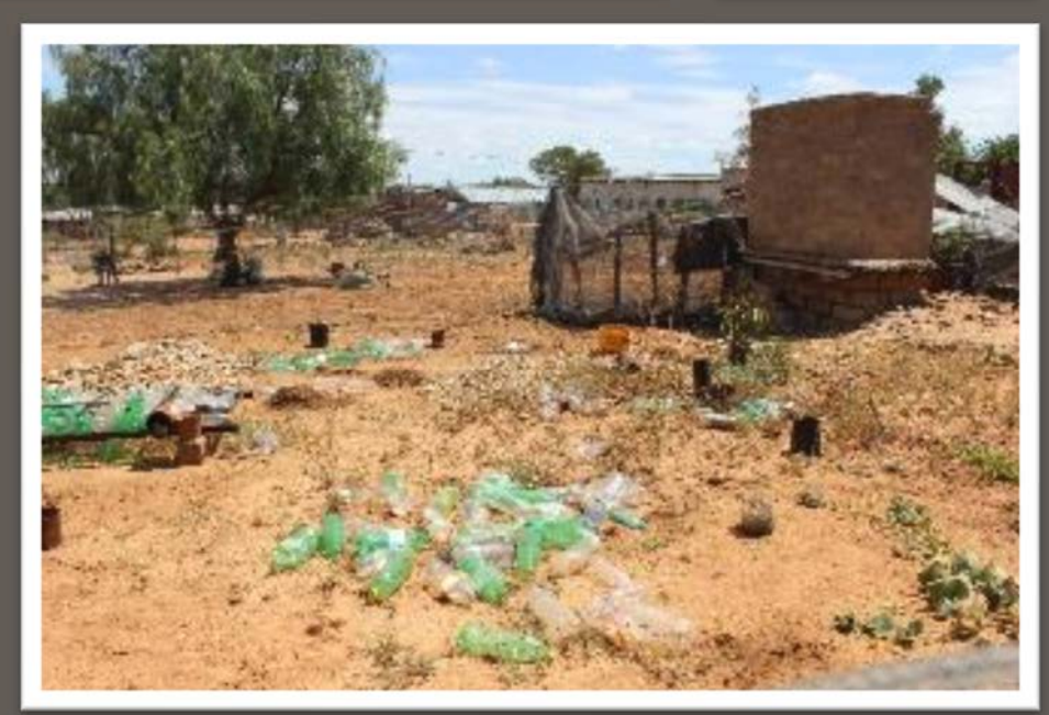
Farmer collecting 2lt bottles to protect millet from being eaten by birds in her garden