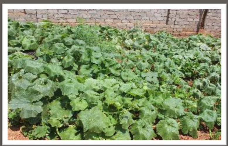
Pumpkin Leaf (Morogo) doing well in Clara's trench bed